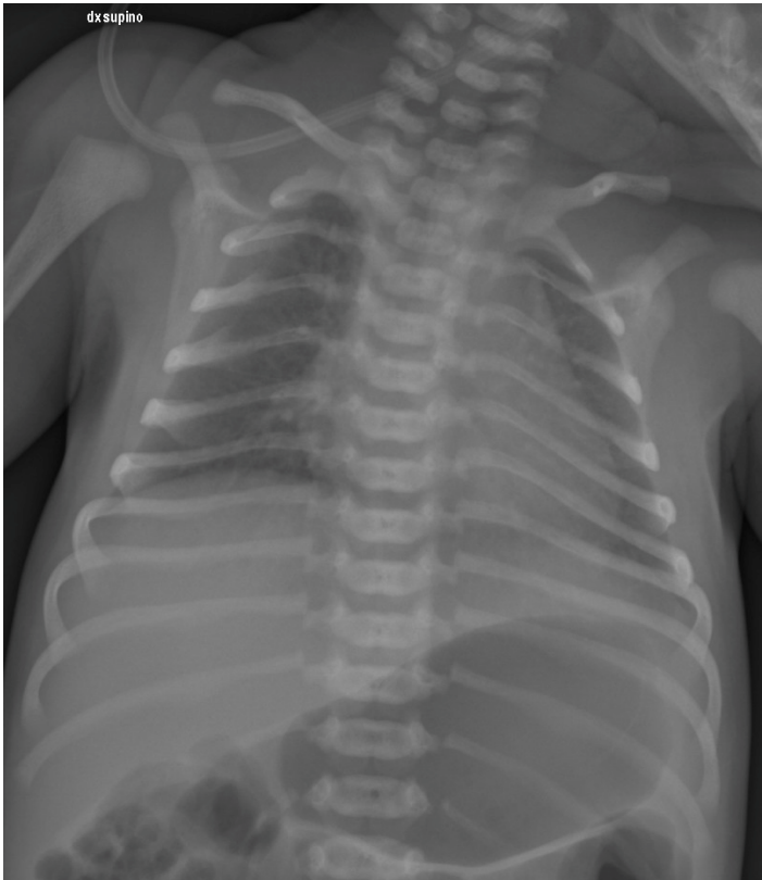
Figure 1. Chest x-ray of the newborn obtained on DOL#3 showing mild bilateral ground-glass opacities